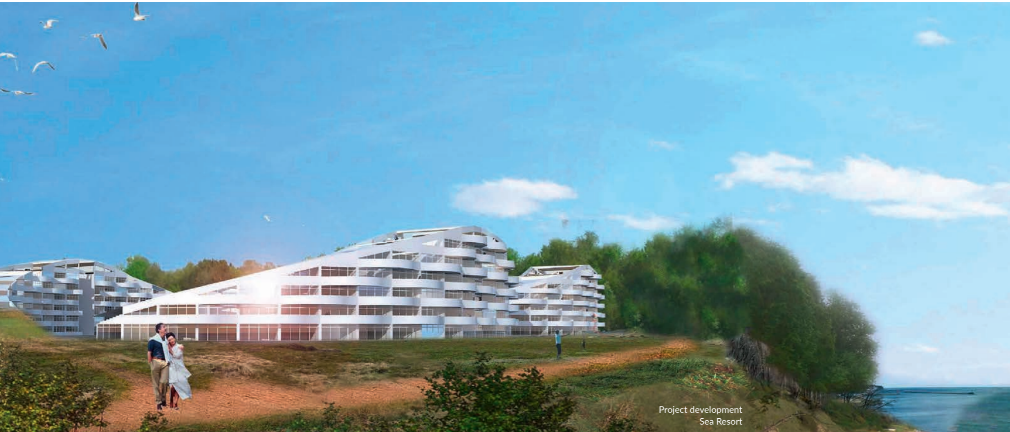
Project development Sea Resort