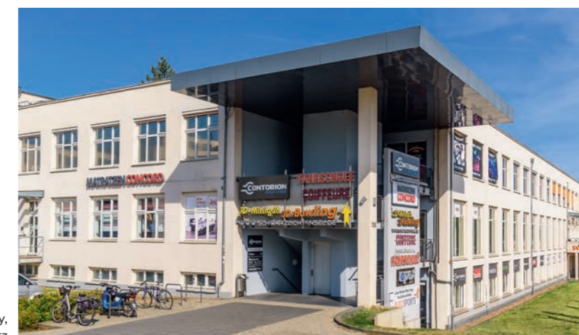
Commercial property, Berlin-Steglitz

Incredibly competent. Absolutely reliable.