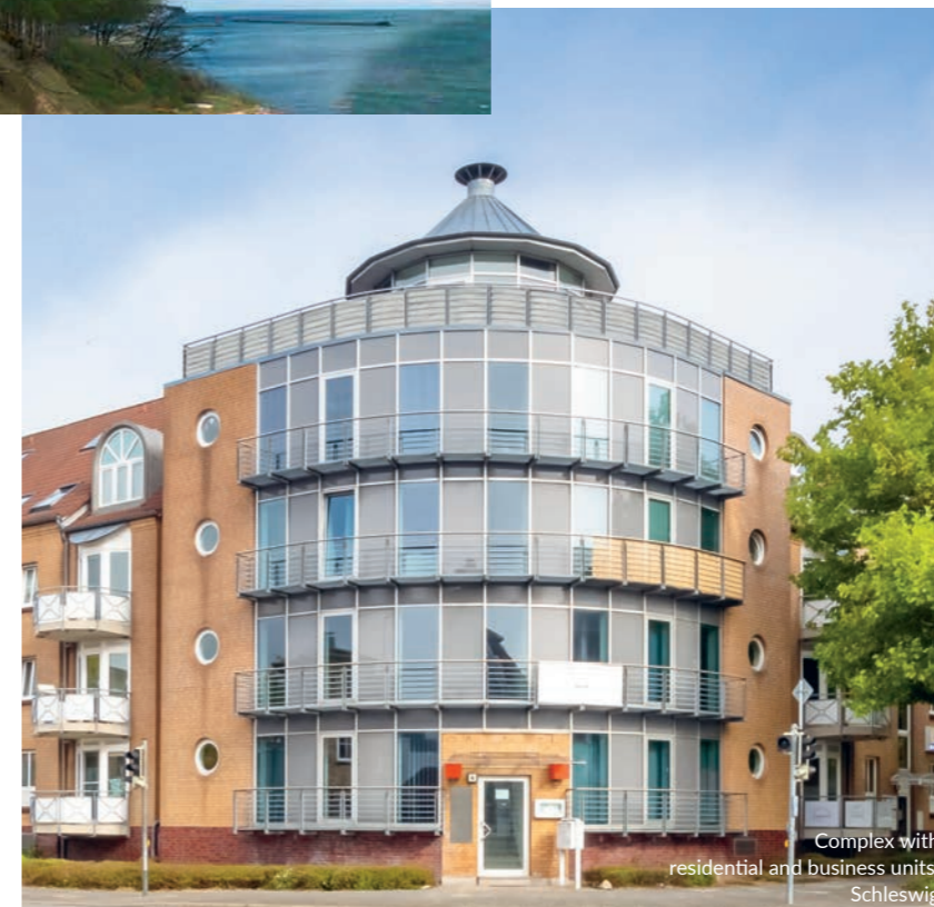
Complex with residential and business units, Schleswig

Whether financing a new purchase or refunding an existing estate property – we support you in choosing the right loan and are on hand with competent help and advice throughout this process.